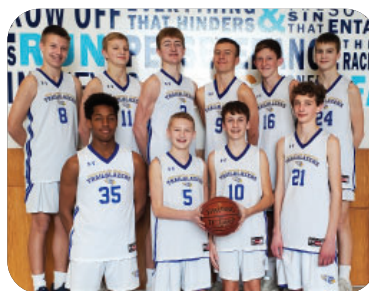
8th grade boys team