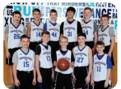
7th grade boys team