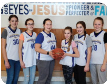
7th grade girls team