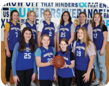
8th grade girls team

THANK YOU to these six coaches who put in a lot of time and effort to help develop the students’ skills and understanding of the game. We also want to thank all of the student athletes for their hard work and commitment throughout the basketball season!