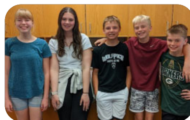
7th grade team

Many of these students placed among the top 20 individual students in each bee, and most of the teams placed among the top four teams in their grade levels.