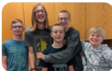
8th grade team