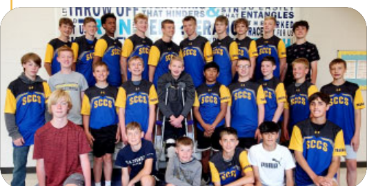
7th & 8th grade boys track team