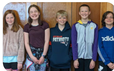
5th grade team

Congratulations to the SCCS students who represented our school at three various Math Bees!