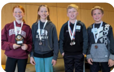
6th grade team