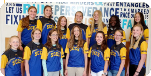
7th & 8th grade girls track team