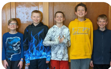
5th grade team