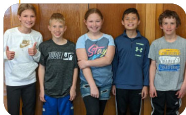
4th grade team