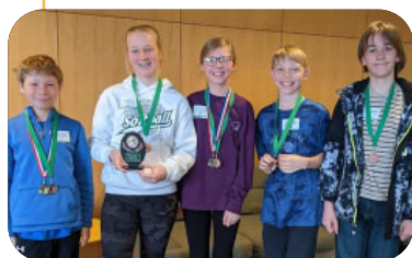
6th grade team

They did a great job using their math skills to solve challenging problems. Dordt University hosted virtual math bees for 4th-5th and 7th-8th grades, and Northwest AEA hosted the 6th grade bee.