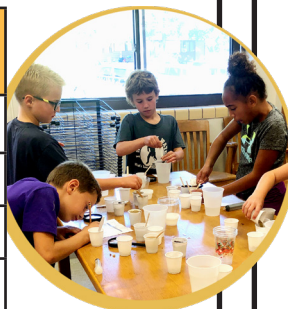
Iowa Dept of Education: SCCS Spring 2021 Iowa Assessments